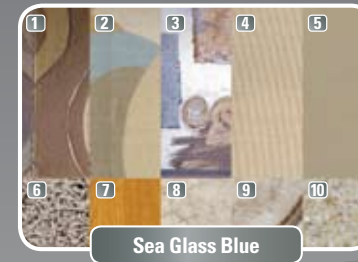
Sea Glass Blue