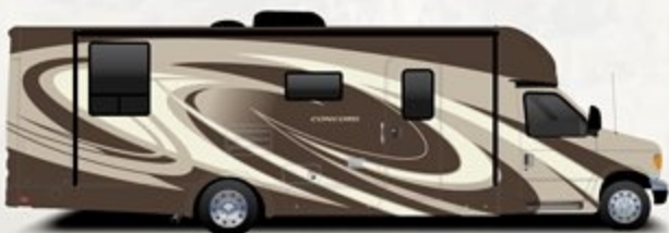
Toffee Full Body Paint (optional)