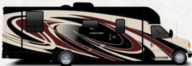
Vermillion Full Body Paint (optional)