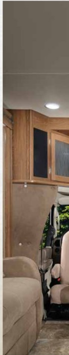
300DS shown with Cocoa Ash cabinets and Linen décor w/Optional Fireplace • Residential Countertop Space w/Double Bowl Sink and Cover.