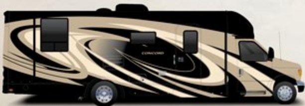
Black Sand Full Body Paint (optional)