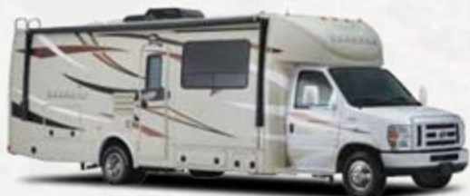
Color-infused Fiberglass (Standard)