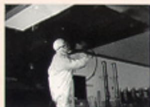
Extensive undercoating applied to each unit provides properly sealed compartments and enhances sound deadening.