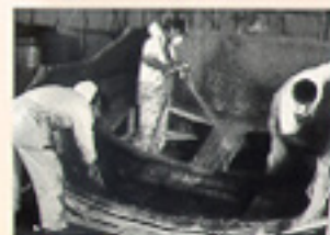
State-of-the-art fiberglass manufacturing holds to tight tolerances and achieves the highest levels of quality.