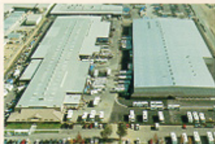
National RV's lot of satisfied customers keeps growing, and so do our facilities. We've recently expanded for even more efficient production capabilities.

From the moment we opened our doors in 1963, National RV began building a reputation for superior products. Because we know that there are no shortcuts to quality, we have always insisted on the most thorough engineering, the best materials, and the finest craftsmanship.