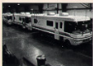
National RV's modern facilities are designed for smooth, error-free automated production every step of the way.