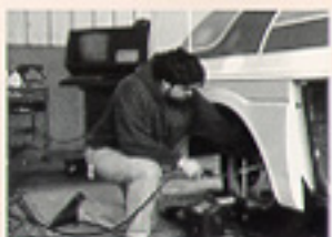
After being aligned on the most advanced electronic equipment, every National RV motorhome is road tested for ride and handling.