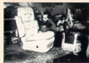
Custom designed furniture receives its finishing touches in our factory to guarantee high levels of quality and comfort.