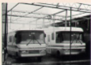
Each unit is thoroughly rain-tested before delivery. This important step helps assure a quality motorhome.