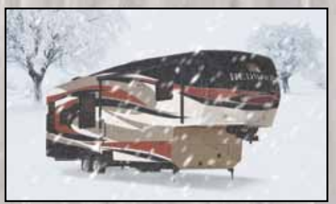
DOMETIC TESTED IN EXTREME TEMPERATURES

True Full Time Living Coach! Redwood was tested in sub-zero temperatures and passed for extreme weather camping.