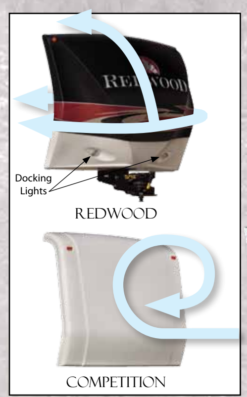
WIND TUNNEL TESTED FOR MAXIMUM FUEL ECONOMY AND TOWABILITY