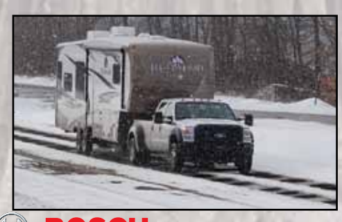
BOSCH TESTING TRACK

True Full Time Living Coach! Redwood was tested in sub-zero temperatures and passed for extreme weather camping.