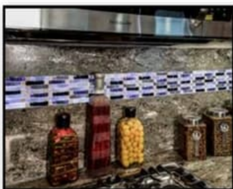
BACKLIT KITCHEN BACKSPLASH TILE