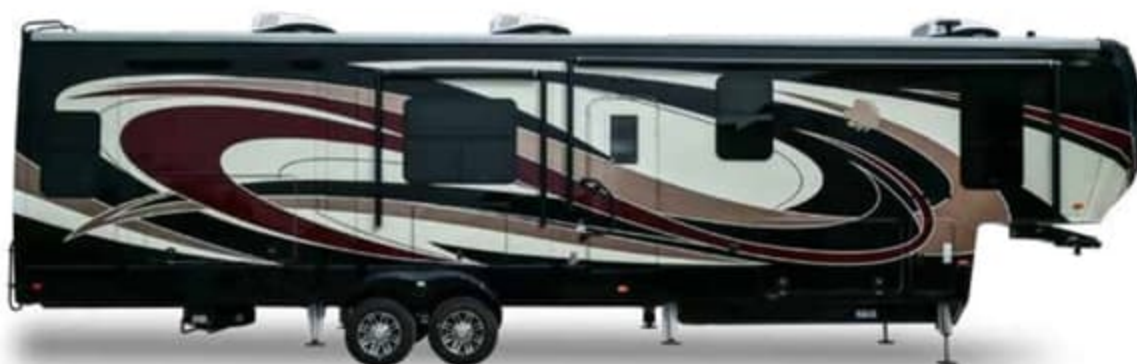
BLACK & RED FULL BODY PAINT

AT LANDMARK BEAUTY IS MUCH MORE THAN SKIN DEEP, BUT WE DO HAVE PLENTY OF EYE CANDY: