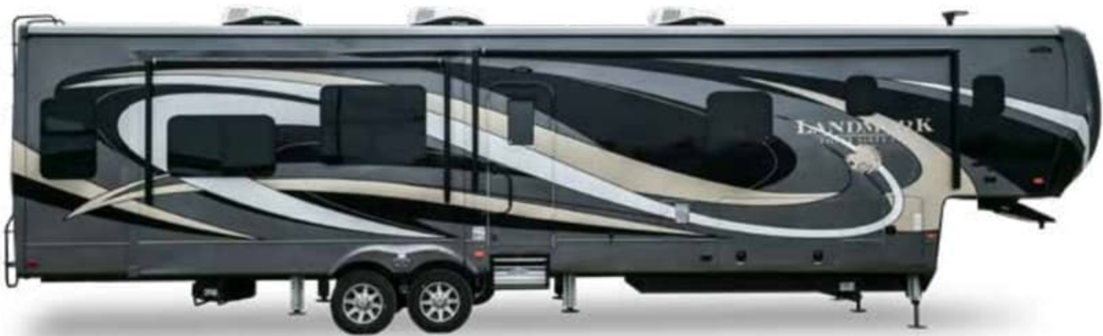
BLACK & SILVER FULL BODY PAINT