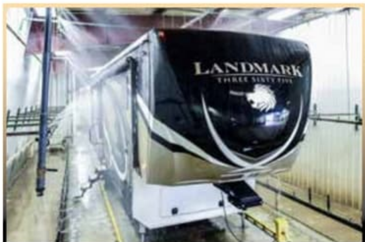
127 SPRINKLER RAIN BAY TEST