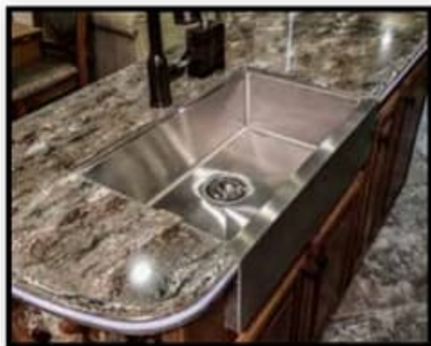
SINGLE BASIN FARMHOUSE SINK