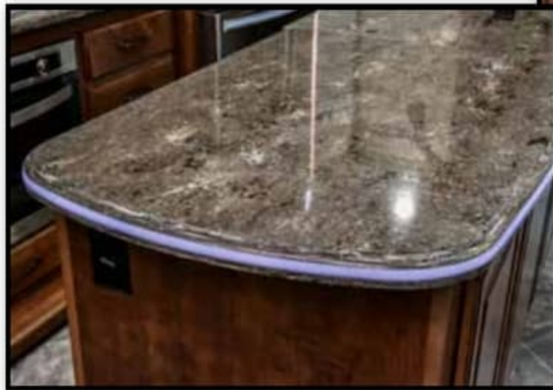
THE OSHKOSH FEATURING ENGLISH TOFFEE DECOR.

NOT ONLY DO WE RESEARCH MARKET TRENDS, RVER LIFESTYLES AND HOUSING IDEAS, BUT WE KNOW A STREAMLINED LAYOUT THAT MAXIMIZES LIVING, EFFICIENCY AND STORAGE IS THE KEY TO DELIVERING THE FULL-TIME RV EXPERIENCE YOU EXPECT.