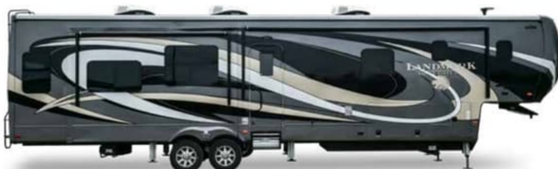
BLACK & SILVER FULL BODY PAINT