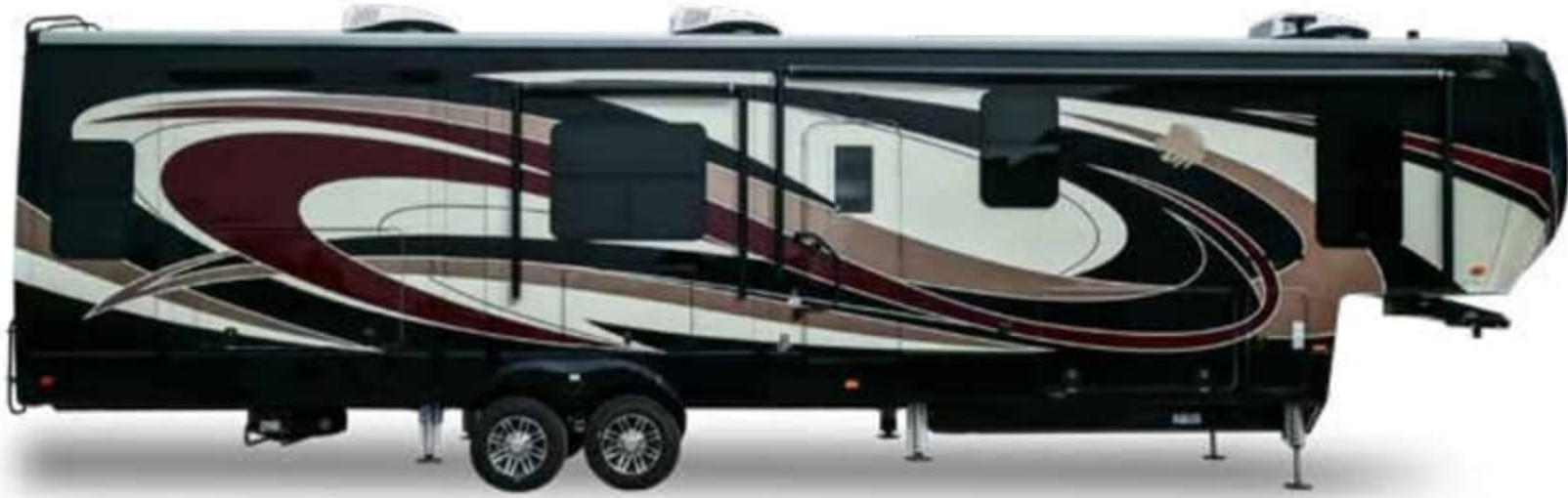
BLACK & RED FULL BODY PAINT

AT LANDMARK BEAUTY IS MUCH MORE THAN SKIN DEEP, BUT WE DO HAVE PLENTY OF EYE CANDY: