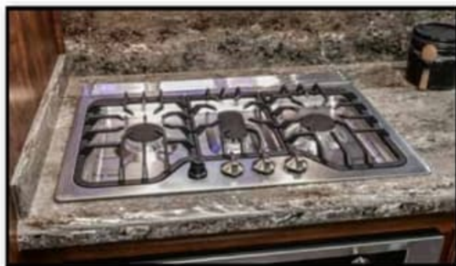
THREE BURNER GAS COOKTOP WITH AUTO IGNITE.