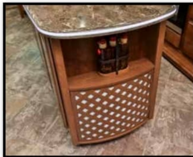
ISLAND END SHELF