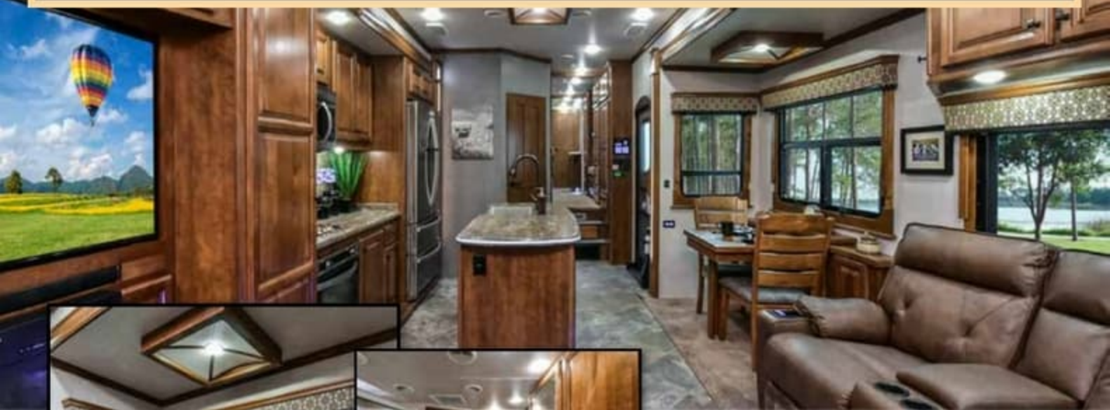
SHOWN IN CHOCOLATE SILK DECOR

ENJOY THE DYNAMIC LIVING ROOM, A BEAUTIFUL FULL BATH AND A HALF, AND THE FULLY LOADED KITCHEN. THE ORIGINAL "365" FLOORPLAN AND STILL ONE OF OUR CORE FLOORPLANS.