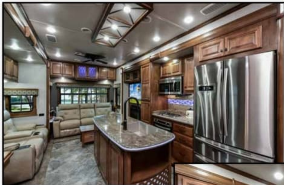
THE OSHKOSH FEATURING ENGLISH TOFFEE DECOR.

NOT ONLY DO WE RESEARCH MARKET TRENDS, RVER LIFESTYLES AND HOUSING IDEAS, BUT WE KNOW A STREAMLINED LAYOUT THAT MAXIMIZES LIVING, EFFICIENCY AND STORAGE IS THE KEY TO DELIVERING THE FULL-TIME RV EXPERIENCE YOU EXPECT.