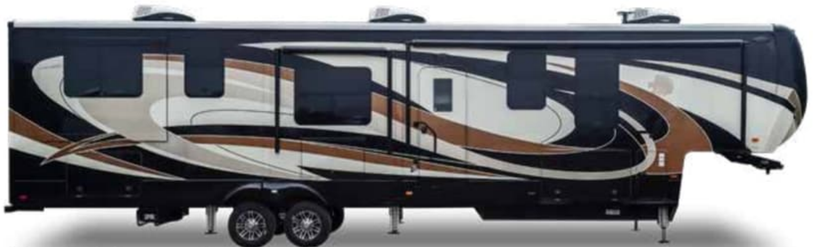
BLACK & COPPER FULL BODY PAINT