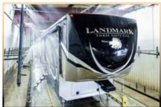
127 SPRINKLER RAIN BAY TEST