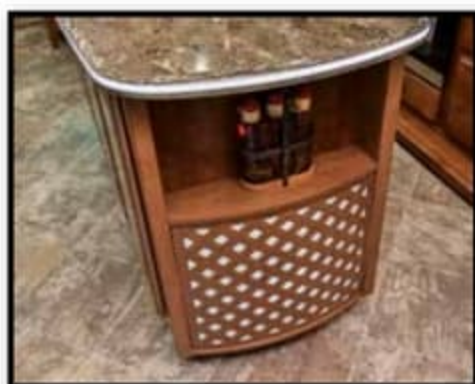
ISLAND END SHELF