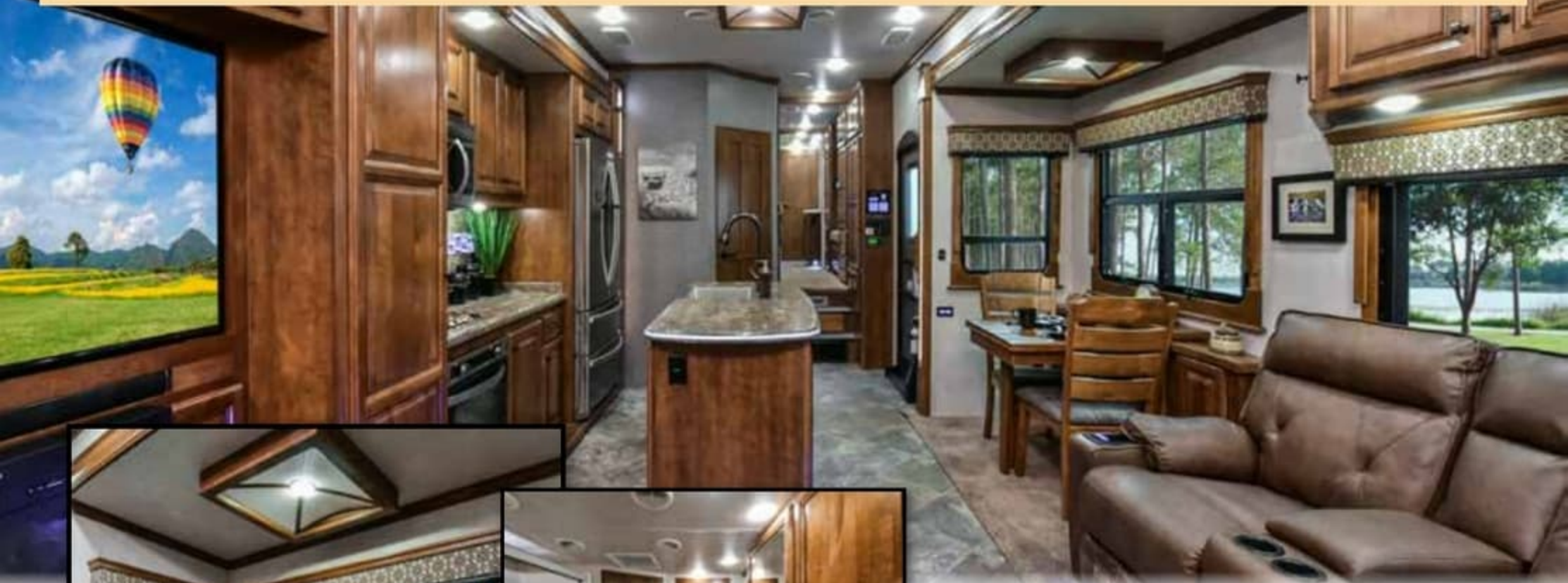
SHOWN IN CHOCOLATE SILK DECOR

ENJOY THE DYNAMIC LIVING ROOM, A BEAUTIFUL FULL BATH AND A HALF, AND THE FULLY LOADED KITCHEN. THE ORIGINAL "365" FLOORPLAN AND STILL ONE OF OUR CORE FLOORPLANS.