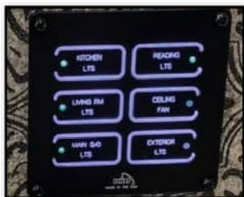
MULTIPLEX LIGHTING SYSTEM