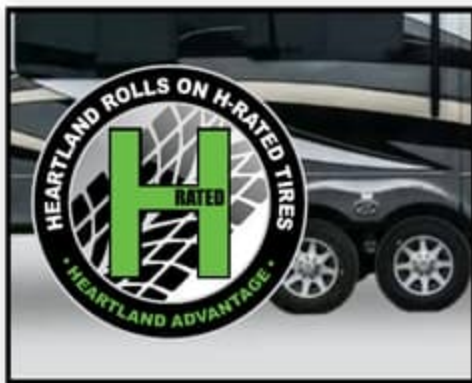
H-RANGE TIRES ON 8,000LBS AXLES