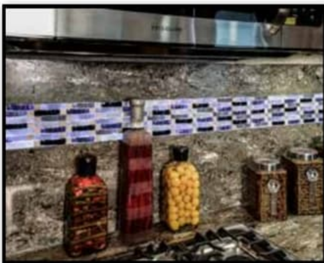
BACKLIT KITCHEN BACKSPASH TILE