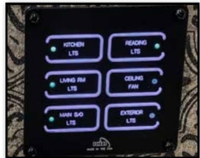
MULTIPLEX LIGHTING SYSTEM