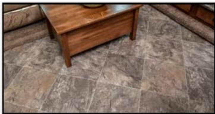
FULLY LAMINATED FLOOR NO WEAK SPOTS.

THE OSHKOSH BEDROOM FEATURES A 40" TV AND A 5100BTU FIREPLACE NEXT TO THE DRESSER.