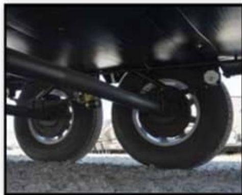
DEXTER AXLES WITH 3-3/8" BRAKES