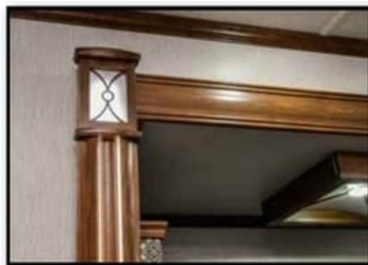
BACKLIT AND DIMMABLE SLIDE OUT FASCIA.

THE BOTTOM LINE IS LANDMARK ADDS LONGEVITY TO YOUR COACH WITH BOTH CONSTRUCTION AND END-USER FEATURES.