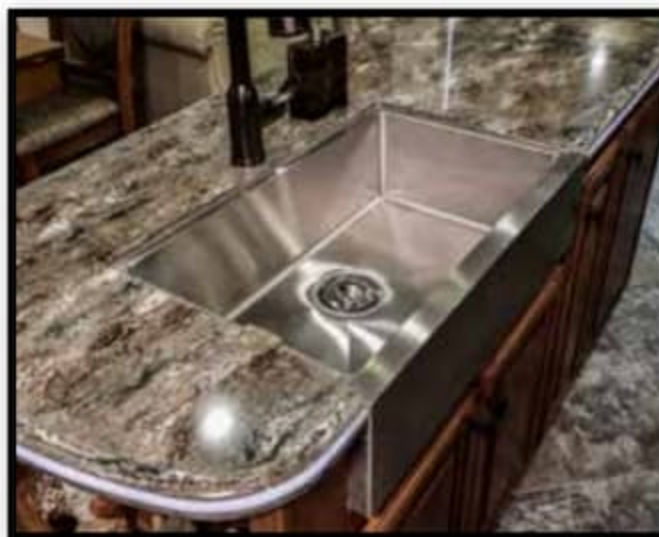
SINGLE BASIN FARMHOUSE SINK