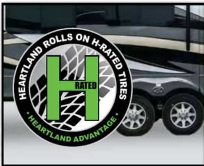
H-RANGE TIRES ON 8,000LBS AXLES

ENJOY A LARGE KITCHEN WITH FLOOR TO CEILING PANTRY, A MASTER SUITE WITH 20" DEEP DRESSER, WALK IN CLOSET AND POWER TILT BED FOR MAXIMUM COMFORT AND STORAGE. PHOENIX ALSO FEATURES A RAISED REAR DEN ABOVE AN ENORMOUS BASEMENT STORAGE AREA WITH MOTOR HOME STYLE PULL-OUT TRAY STORAGE.