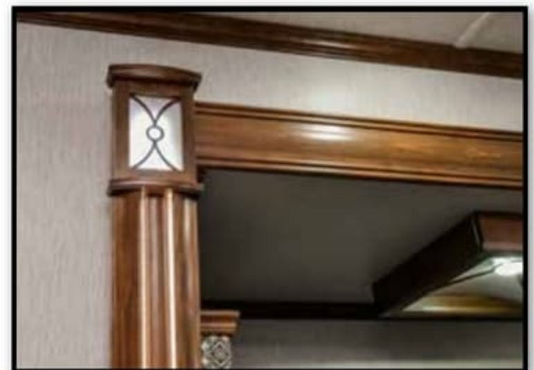
BACKLIT AND DIMABLE SLIDE OUT FASCIA.

THE BOTTOM LINE IS LANDMARK ADDS LONGEVITY TO YOUR COACH WITH BOTH CONSTRUCTION AND END-USER FEATURES.