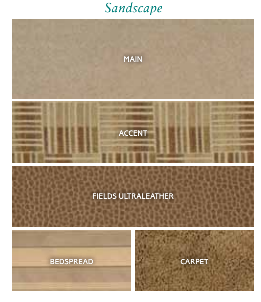
Fabrics and carpets may change without notice or obligation.