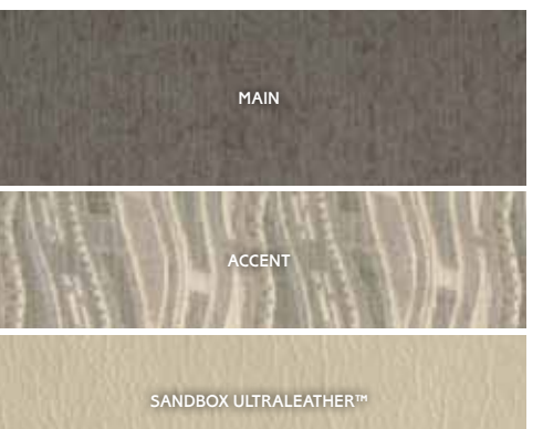
SANDBOX ULTRALEATHER™ BEDSPREAD CARPET